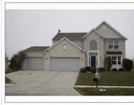
see additional photos below